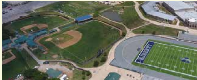
Liberty Christian School

Homeowners with children appreciate having access to two renowned Texas school districts: Argyle ISD and Northwest ISD, and within five miles, a private pre-K-12th grade option. And with two more on-site elementary schools, parents will have several options to choose from.